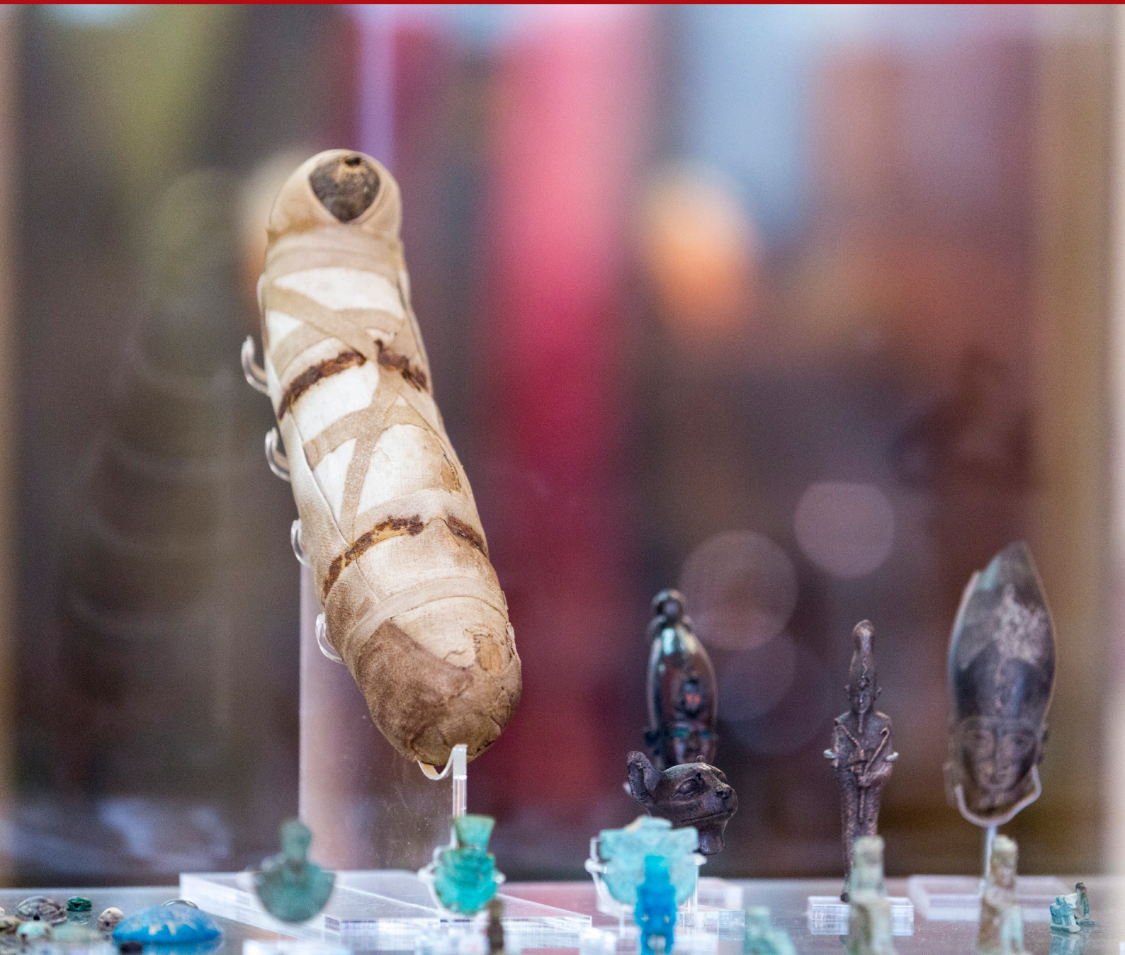
The Ancient Egyptian Case, The Beaney

The ancient Egyptians invented a writing system called hieroglyphs and worshiped over 2,000 gods and goddesses!